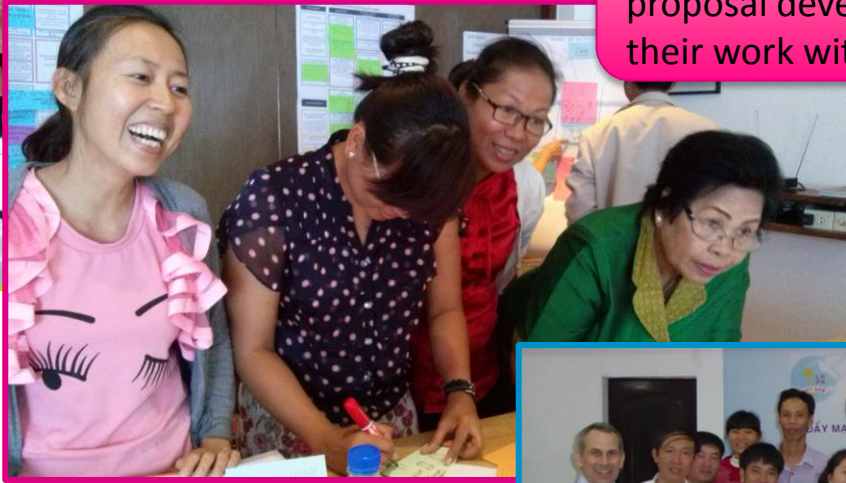
Cambodia –GCWG members build capacity in climate change mitigation proposal development to support their work with women in agriculture.