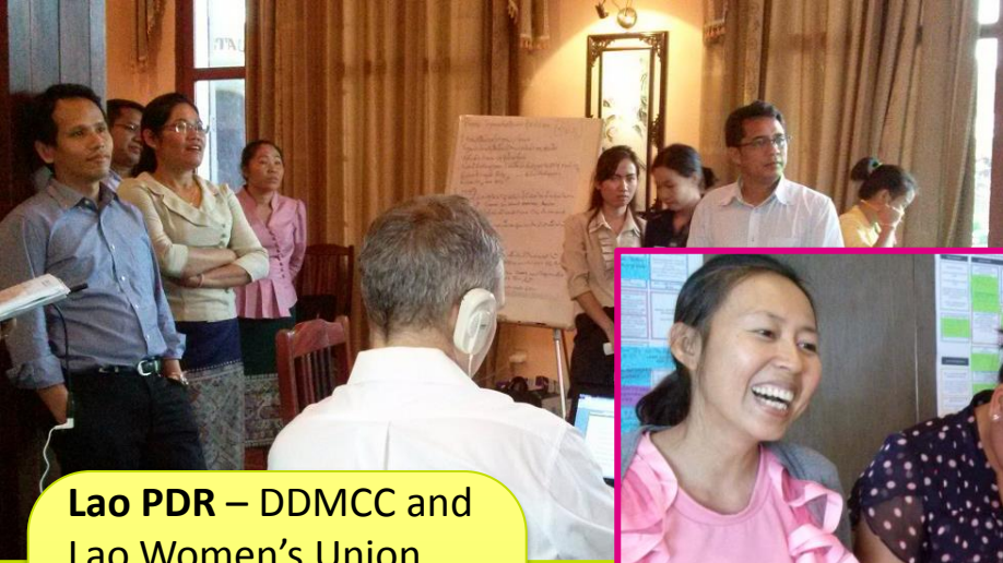
Lao PDR – DDMCC and Lao Women’s Union members work together to integrate gender responsiveness in the national Climate Change Action Plan.