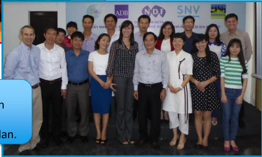
Vietnam – URENCO, DoNRE, Dong Hoi city authorities, and the Women’s Union work on introducing climate change mitigation and gender mainstreaming into the city action plan.