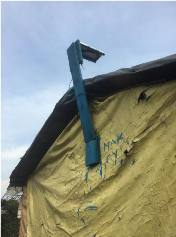
Solar panel on a roof In Barangay 128, Manila