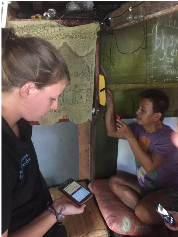
Activation of a battery in Barangay 128