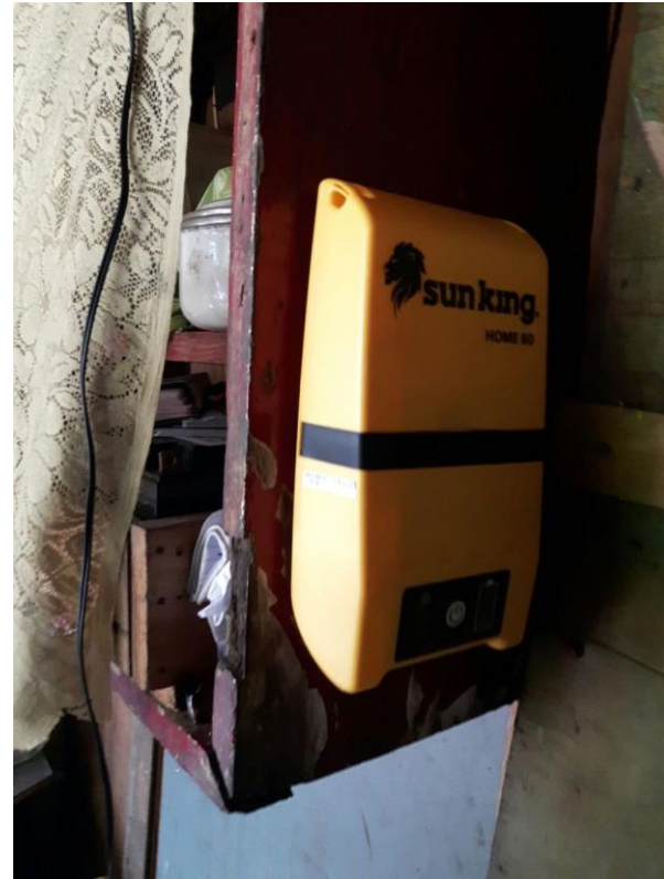
Installed battery in one house In Barangay 128, Manila