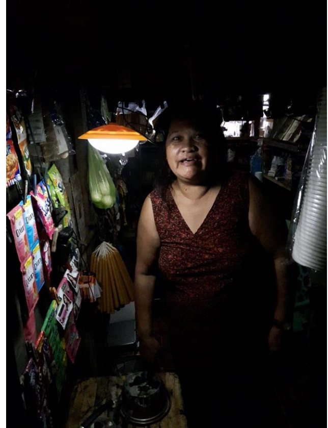
ATE Co. 100th client