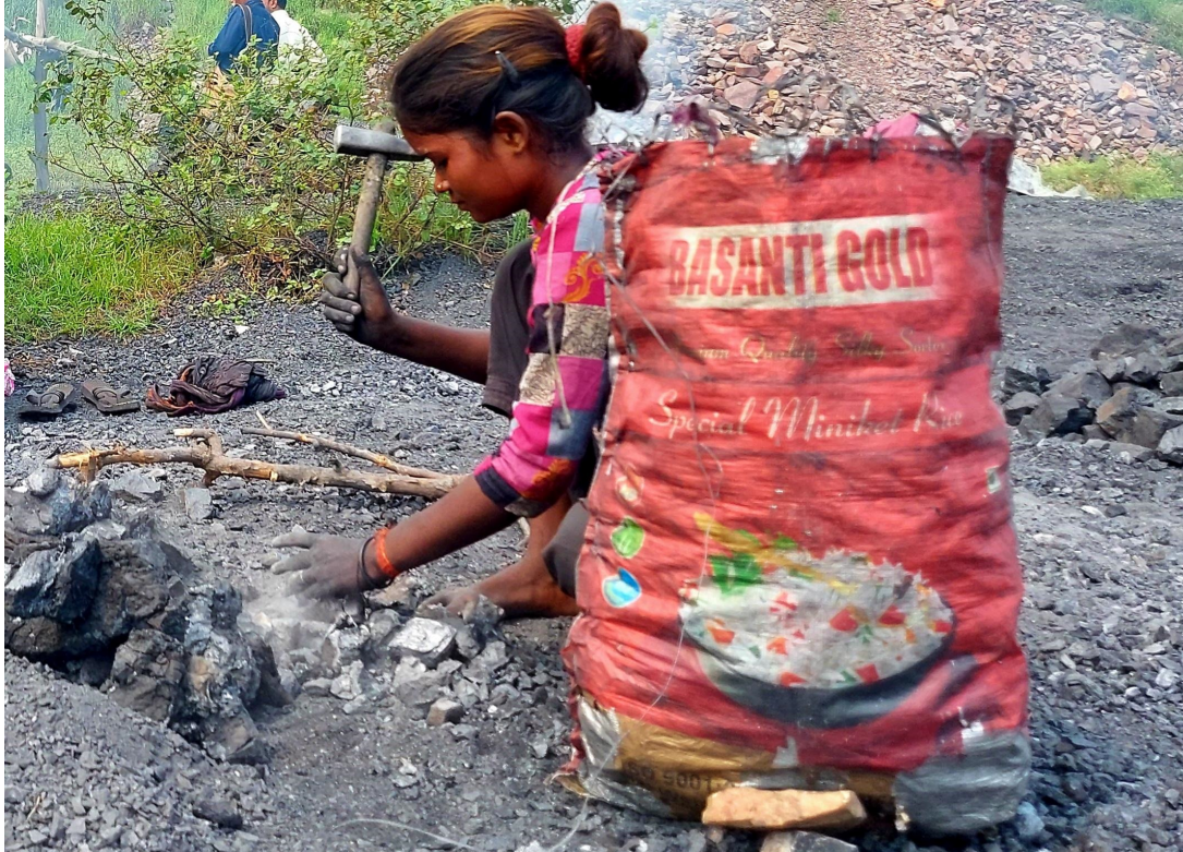
Coal gathering and selling, Jharkhand