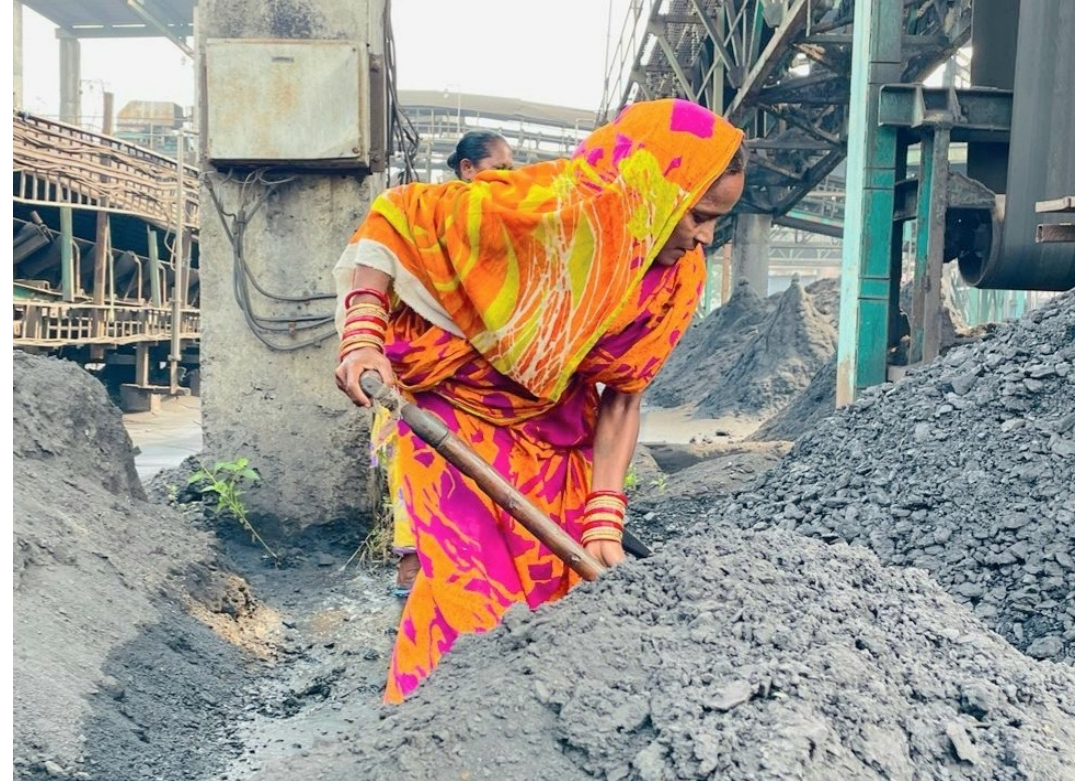
Cleaning slurry, Odisha