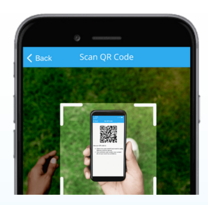
QR Code will be received on Whova app after registration!

At check-in, you can either provide your name or show the QR code received after registration, and the staff will check you in. Ushers will scan your QR code when you enter the session rooms at ACEF, so please keep it easily accessible.