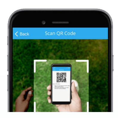
QR Code will be received on Whova app after registration!

At check-in, you can either provide your name or show the QR code received after registration, and the staff will check you in. Ushers will scan your QR code when you enter the session rooms at ACEF, so please keep it easily accessible.